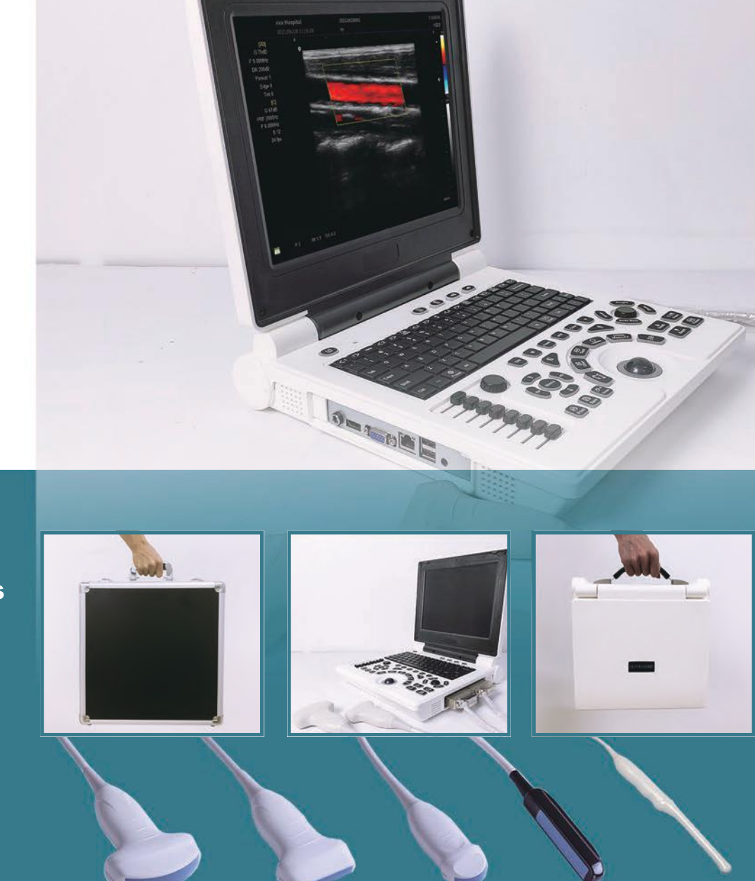
3.5Mhz convex probe